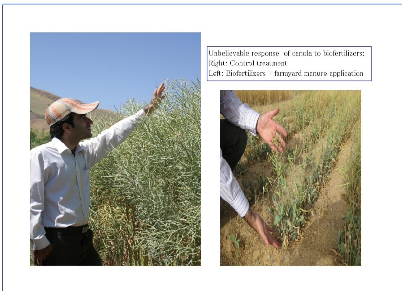
Figure 2. Response of canola growth to biofertilizers (Mohammadi, 2011)